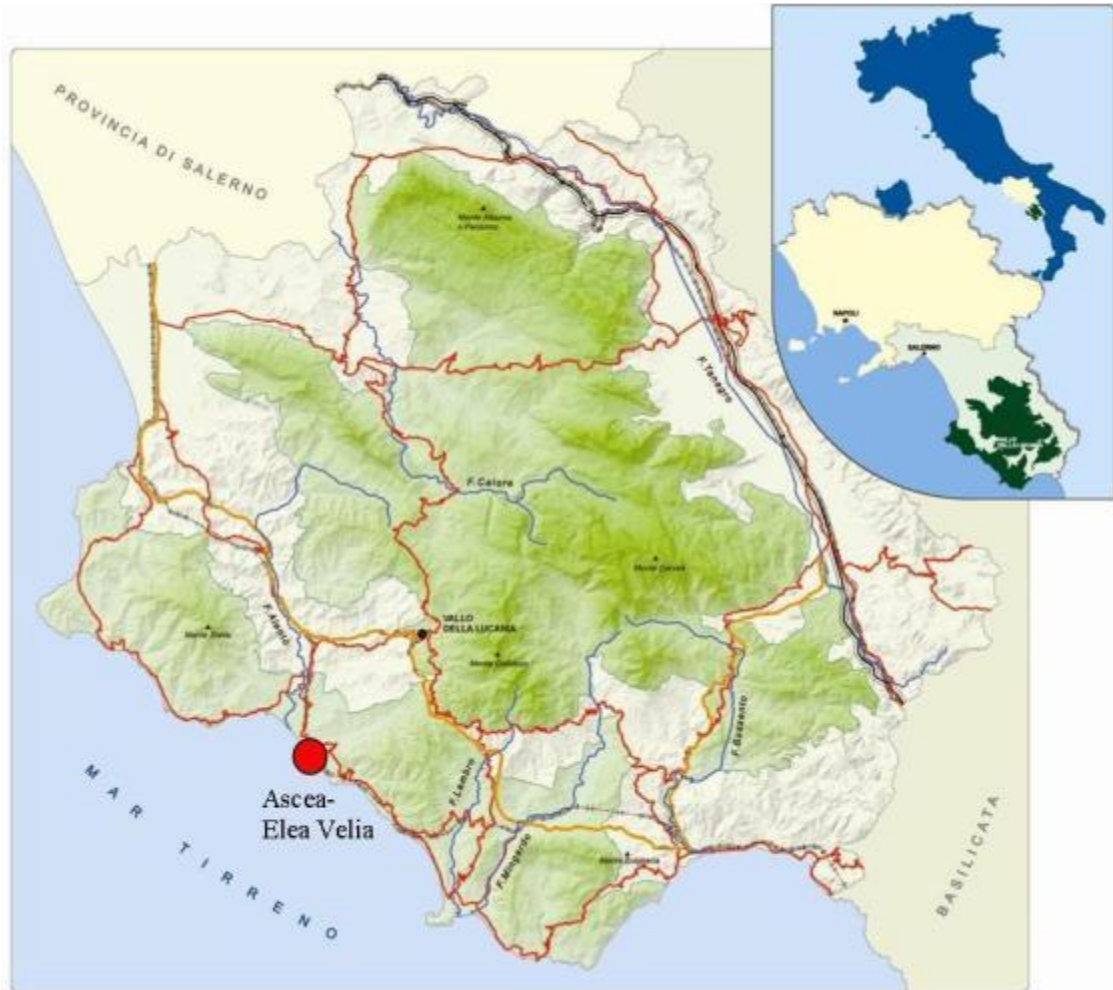
Figure 2: Location of Cilento, Vallo Diano and Alburni National Park-Geopark and Ascea-Velia-Elea

The 12th European Geoparks Conference will be held in Ascea-Velia-Elea, village located along the coast of the Cilento, Vallo Diano and Alburni National Park-Geopark, in the Campania Region southern Italy (fig.2).